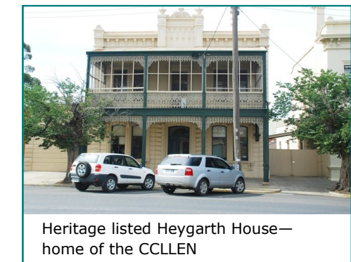
Heritage listed Heygarth House— home of the CCLLEN